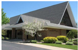
Gaylord First UMC

You are responsible for lodging in Gaylord. There are a block of rooms with a group rate at the Baymont Inn 989-731-6331.