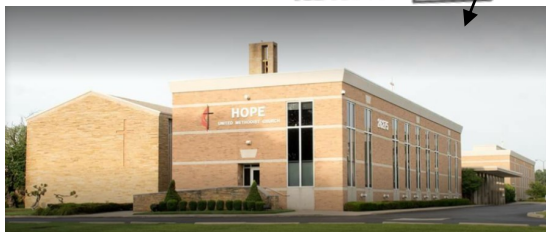
Southfield Hope United Methodist Church