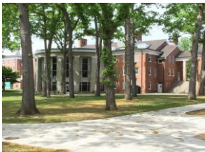
Baldwin Hall at Albion College