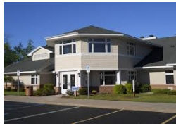
The Lodge at Lake Huron Retreat Center