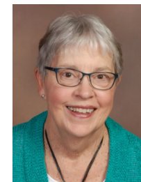
Genie Bank (W & E)